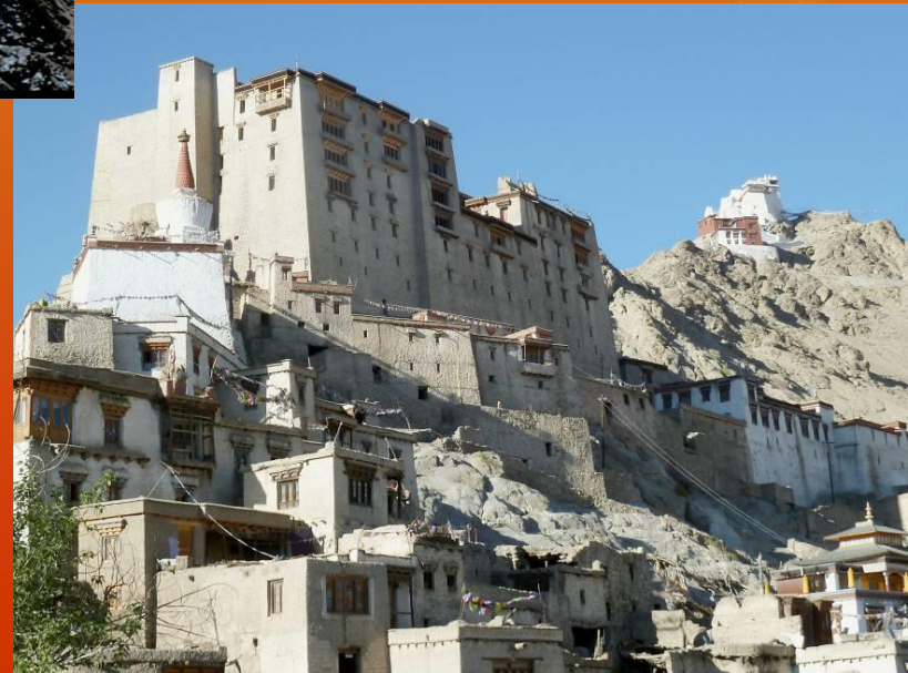
Mountain village in the Himalayas