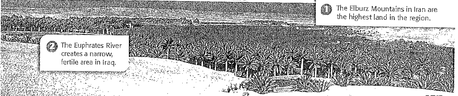
2 The Euphrates River creates a narrow, fertile area in Iraq.